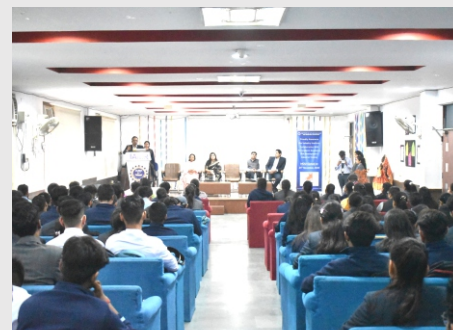
INDUSTRY INSTITUTE COLLABORATION