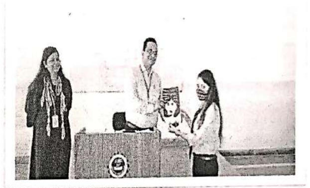
Painting competition on Women's Day.